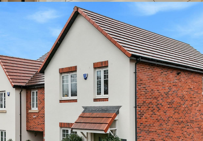
4 Canyon Meadow Creswell, Worksop, S80 4UQ £250,000